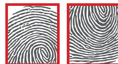
Placement variations on smaller sensors

The CBM's capture surface (14x22mm) ensures that the richest area on fingerprints is systematically captured time after time. Acquisition surface contributes significantly to the overall biometric performance: