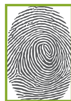
MSO 1300 Series Capture