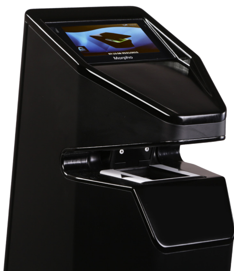
MorphoWave™ Desktop integrated into our Access Control solution (MorphoWave™ Tower by IDEMIA)