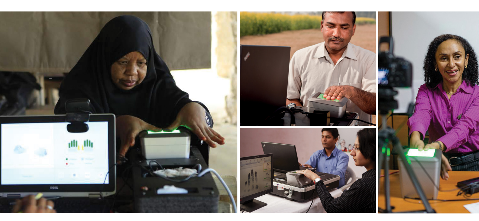
Fingerprint capture during voter registration, Kenya